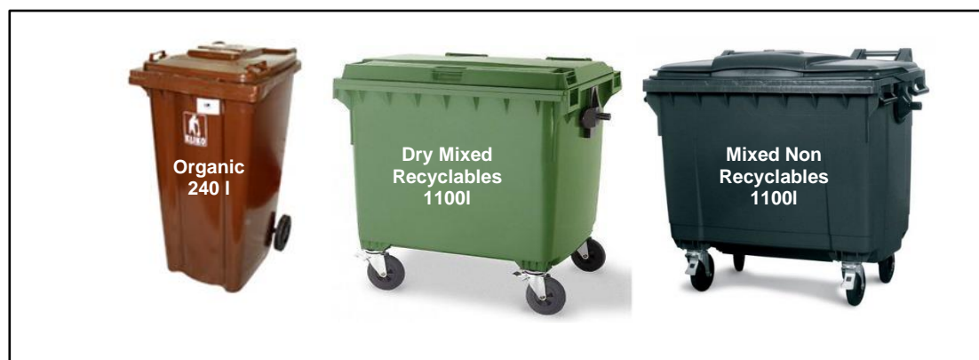
Figure 5.1 Typical waste receptacles of varying size (240L and 1100L)

The types of bins used will vary in size, design and colour dependent on the appointed waste contractor. However, examples of typical receptacles to be provided in the WSA are shown in Figure 5.1. All waste receptacles used will comply with the IS EN 840 2012 standard for performance requirements of mobile waste containers, where appropriate.