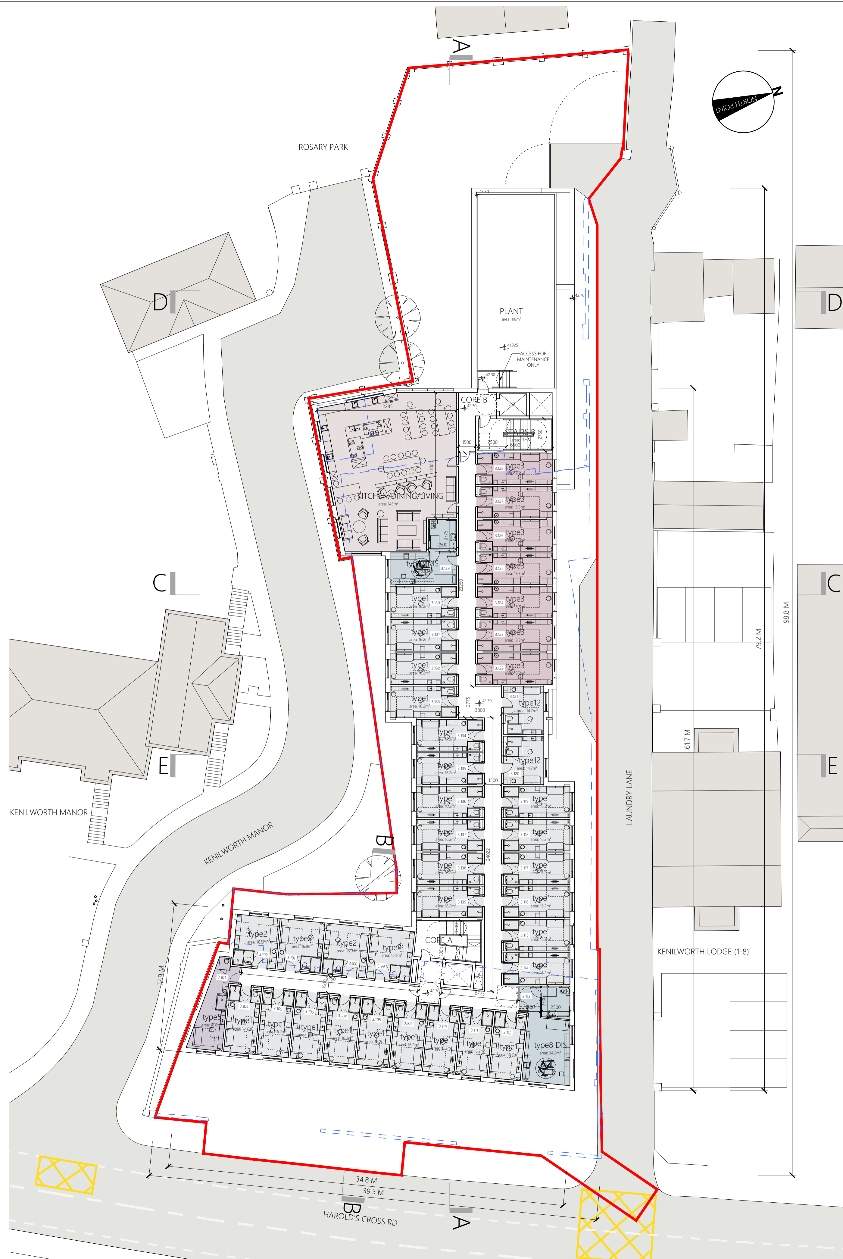
5 THIRD FLOOR PLAN (LEVEL 3) SCALE 1:200